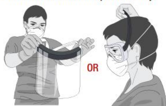
Step 4: Cleaning

9 Remove eye protection by pulling the string from behind the head and dispose of it safely.