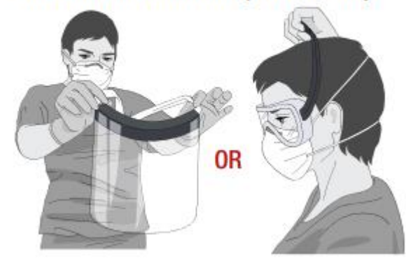
Step 4: Cleaning

9 Remove eye protection by pulling the string from behind the head and dispose of it safely.