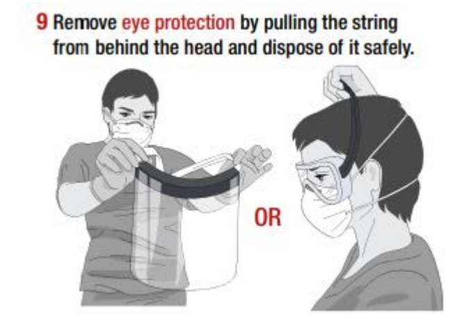
Step 4: Cleaning

Step 3: Remove the visor by pulling the string from behind